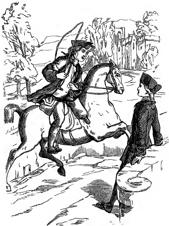
A Welcome to Old England.